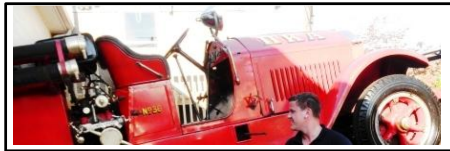
Homecoming Parade 2013